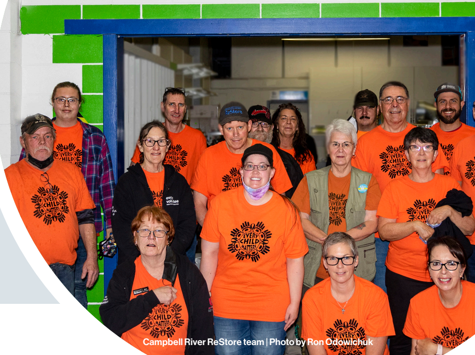
Campbell River ReStore team | Photo by Ron Odowichuk