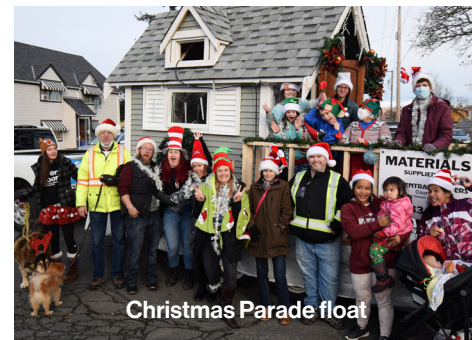
Christmas Parade float