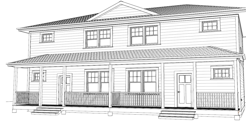
477 Hilchey Road, Campbell River 4 units completed; 7 to go

2018 was the first year in our history that we built in two communities at the same time.