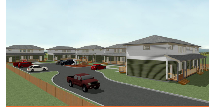
1330 Lake Trail Road, Courtenay 2 units completed; 8 to go