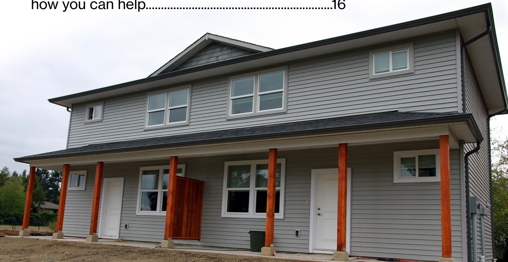
The duplex we built this year on 477 Hilchey Road—the first two homes in what will be an 11-unit project.