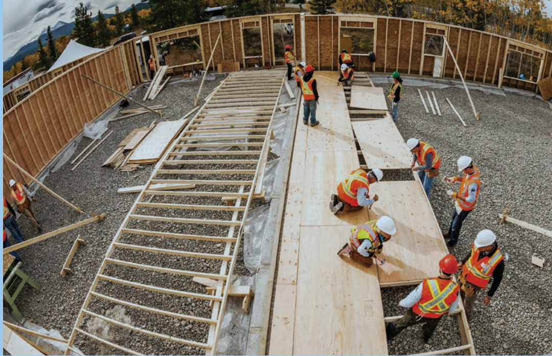
THE BUILD TEAM PREPARES THE FINAL WALL DURING THE LEADERSHIP BUILD WEEK.

Aboriginal peoples have a deep spiritual, physical, social and cultural connection to their land, so building homes within Aboriginal communities must be undertaken with widespread support.