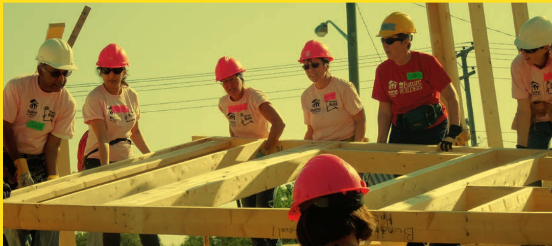
WOMEN BUILD VOLUNTEERS HELPING BUILD AN AFFORDABLE HOME FOR A LOW-INCOME FAMILY IN MANITOBA LAST YEAR.