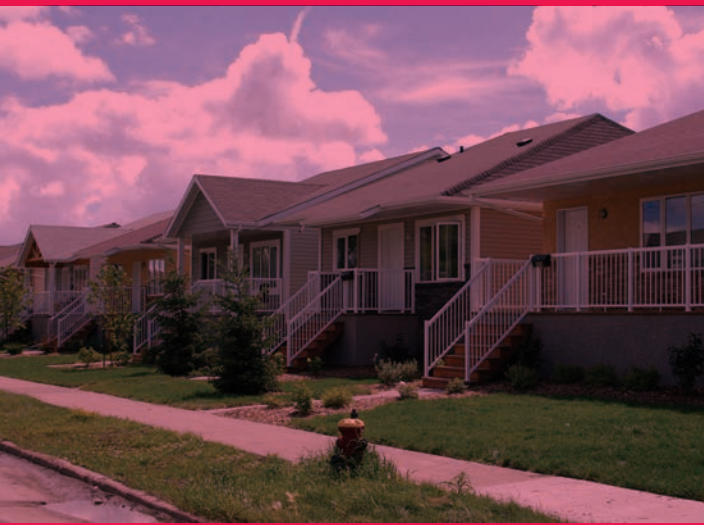
ABOVE: PART OF HABITAT FOR HUMANITY MANITOBA'S SIR SAM STEELE 32-HOME SUSTAINABLE DEVELOPMENT IN WINNIPEG.