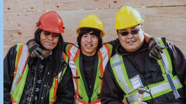
LEFT: THREE CHAMPAGNE AND AISHIHIK COMMUNITY MEMBERS WHO LENT A HAND WHILE BUILDING THEIR SKILLS IN CONSTRUCTION TECHNIQUES. RIGHT: SHAWN ATLEO, ASSEMBLY OF FIRST NATIONS NATIONAL CHIEF, OVERSEEING THE WORK BEING COMPLETED ON THE HABITAT HOME.

LEFT: EXTERIOR WALL RAISING RIGHT: VOLUNTEERS LEAVE THEIR MARK ON THE HOME.