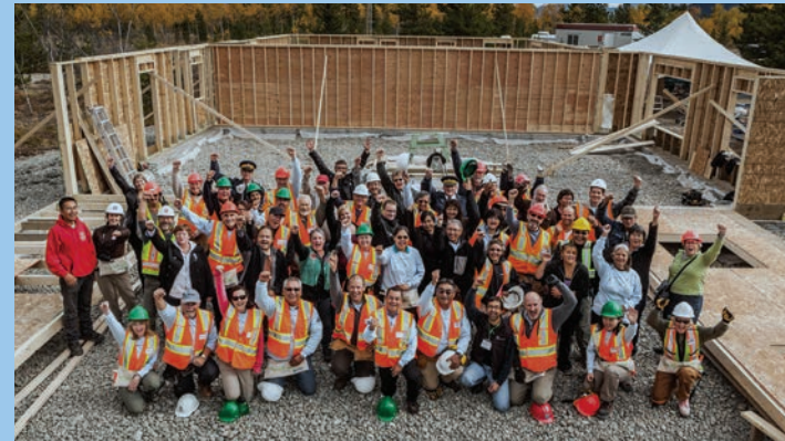
LEFT: LEADERSHIP BUILD WEEK VOLUNTEERS ON THE FINAL DAY OF THE ONE-WEEK BUILD. RIGHT: YUKON LANDSCAPE NEAR THE HABITAT HOME.

With over 1,200 members, the self-governing CAFN are one of the largest of the Yukon's 14 First Nations. Their traditional territory covers over 41,000 square kilometres – 29,000 in southwest Yukon and 12,000 in northern British Columbia. CAFN ties to their land reach back over 8,000 years. As of February 1995, CAFN's right to the Yukon portion of its traditional lands and resources was confirmed with the signing of the Champagne and Aishihik First Nations Final Agreement. The agreement provided ownership for 2,427 square kilometres of land, allowing the CAFN to begin exploring progressive homeownership models to help improve the shelter conditions of families on their settlement land.