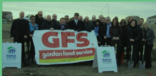
TOP LEFT: SOME OF THE 240 ASSOCIATES OF THE HOME DEPOT CANADA THAT PARTICIPATED AT THE 2012 TORONTO BLITZ BUILD. TOP RIGHT: STILL FROM NISSAN CANADA'S 'GIFT TO YOU' HOLIDAY CAMPAIGN AD. BOTTOM LEFT: ALL WEATHER WINDOWS PLANT EMPLOYEES PROUDLY GATHER FOR A PHOTO DURING THEIR MISSISSAUGA FACTORY BLITZ BUILD. BOTTOM RIGHT: GORDON FOOD SERVICE (GFS) EMPLOYEES AT THE GROUND BREAKING OF THEIR SPONSORED HOME IN CALGARY.