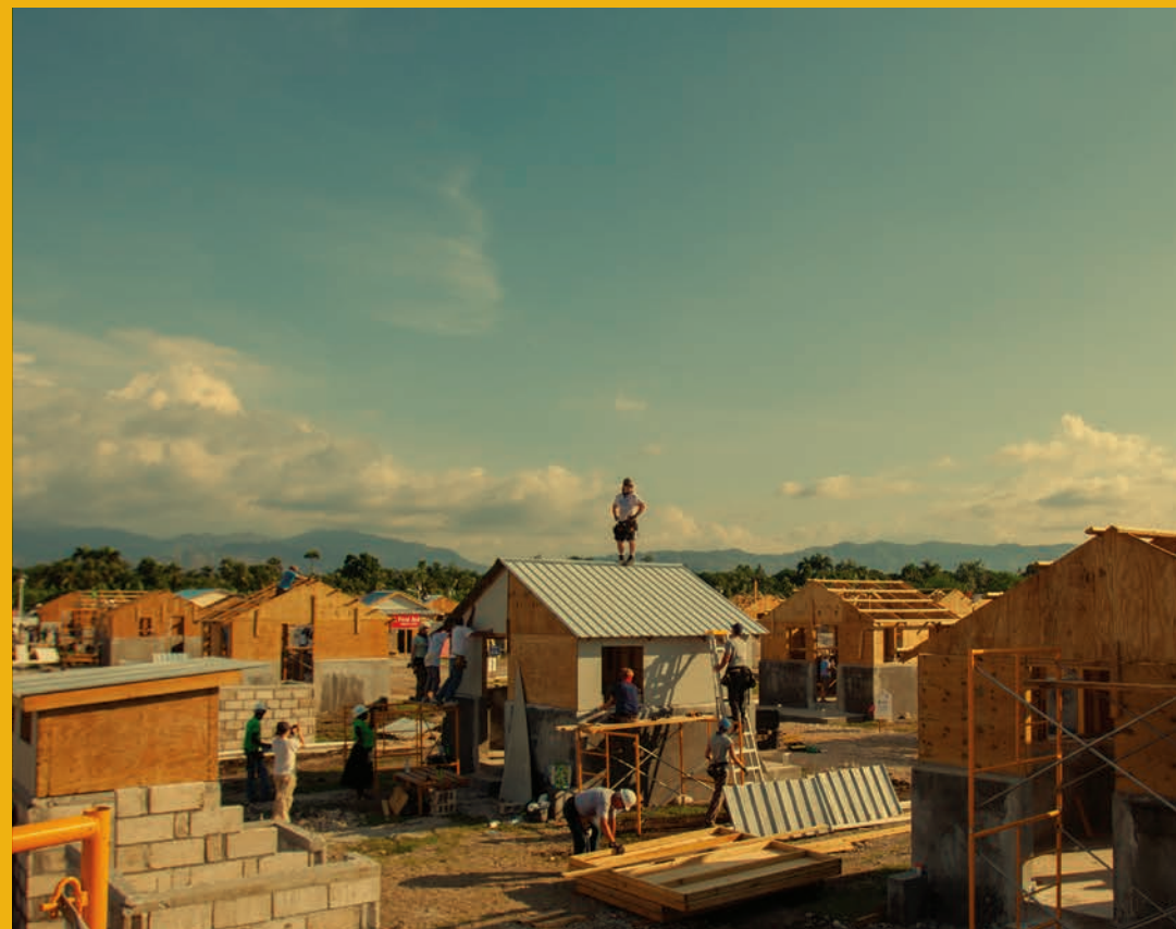
THE JIMMY & ROSALYNN CARTER WORK PROJECT BUILD SITE IN LÉOGÂNE, HAITI, WHERE UP TO 500 HOMES WILL BE BUILT FOR FAMILIES WHO LOST THEIR HOMES IN THE 2010 EARTHQUAKE.

THIS PROJECT WAS UNDERTAKEN WITH THE FINANCIAL SUPPORT OF THE GOVERNMENT OF CANADA PROVIDED THROUGH THE CANADIAN INTERNATIONAL DEVELOPMENT AGENCY (CIDA).